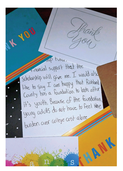
Many students who receive a scholarship send heartfelt thank you notes.

A collaborative effort between the Ohio State University at Mansfield and Mansfield City Schools produced a new program called the Mathematics Literacy Initiative. It provides teachers with strategies to help students overcome barriers to learning mathematics.