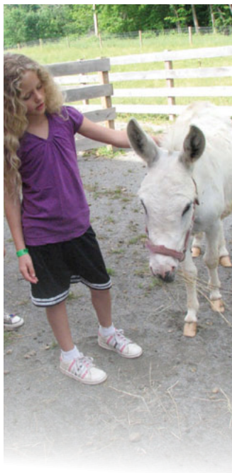
Camp Mowana, Celebration! Day Camp