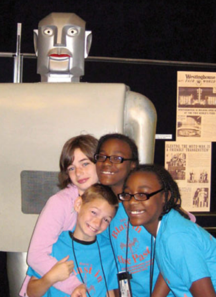
Children visit the Mansfield Memorial Museum through The Salvation Army Motion Commotion 2 program supported by a grant through Richland County Foundation Summertime Kids.

Recently, the University and College Access Network (UCAN) and SPARC merged their efforts under one umbrella. This strong collaborative effort helped to attract a $350,000 grant from the Ohio Board of Regents. Additionally, a $22,500 grant from the Great Lakes Higher Education Guaranty Corporation will help the organization to further high school readiness.