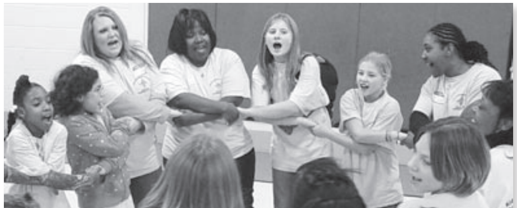
Kid's Connection Girls Empowerment Program

Mansfield Christian School MedCentral College of Nursing MedCentral Health System North Central State College Foundation Ohio Bird Sanctuary Raemelton Therapeutic Equestrian Center Rehabilitation Service of North Central Ohio Renaissance Performing Arts Richland Academy of the Arts Richland County Children Services Shelby Helpline Ministries The Salvation Army The Women's Fund at Richland County Foundation United Way of Richland County Volunteers of America