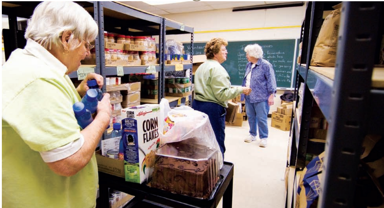
The Plymouth-Shiloh Food Pantry serves 1,000 people each month by an all-volunteer operation working in cooperation with the Village of Shiloh.