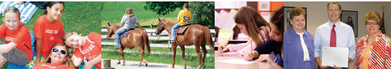
Photos from left to right: The Salvation Army Discovery Zone, Children Services Summertime Kids program, middle school students taking ACT assessment, Teacher Assistance Program (TAP) awards.

Teacher Assistance Program (TAP) awarded $33,968 in grants to 37 teachers for innovative programs that help students learn new skills, engage parents, or increase performance.